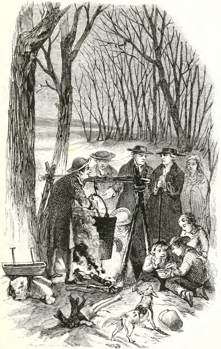
MAKING MAPLE SUGAR. Vol. 1, p. 65.